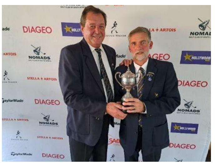
HERMAN BRAAM TROPHY Lincon Construction Challenge: Old Toppies (29,07) vs Young Guns (30,43) Winner: Young Guns