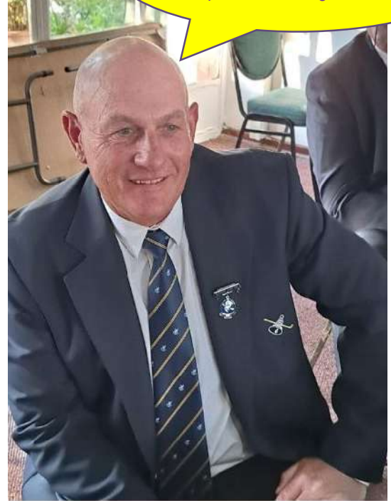
Chopper Pilot, where's your Ray bans??