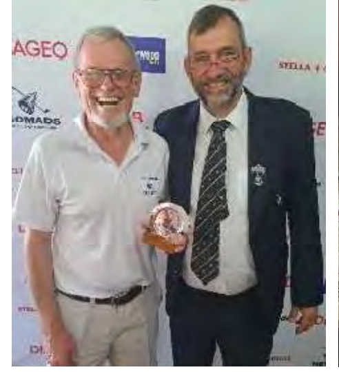
Transfer to Boland Nomads