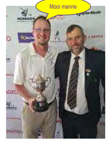
HERMAN BRAAM TROPHY (Lincon Construction Challenge: Ou Toppies 30,14) vs Young Guns 30,18) Winner: Young Guns