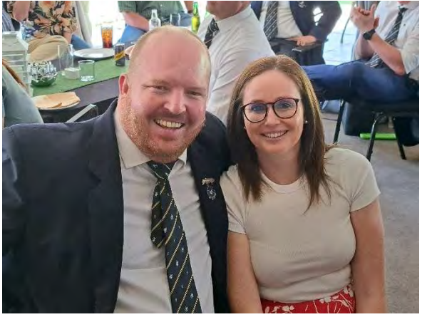
The longer you're married, the further you sit apart