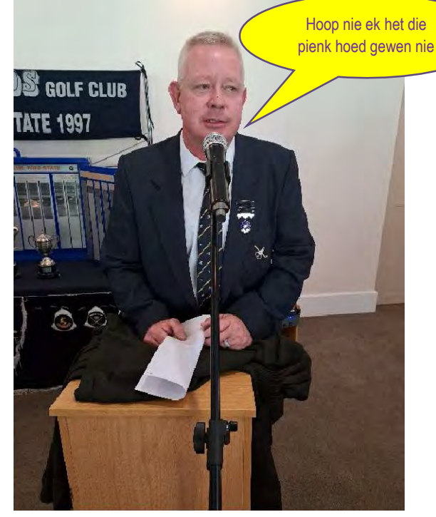
Die sadste Mielie in die Vrystaat???

PRPZHEZELVCINGNGmild/essekted(stefa)(VC)