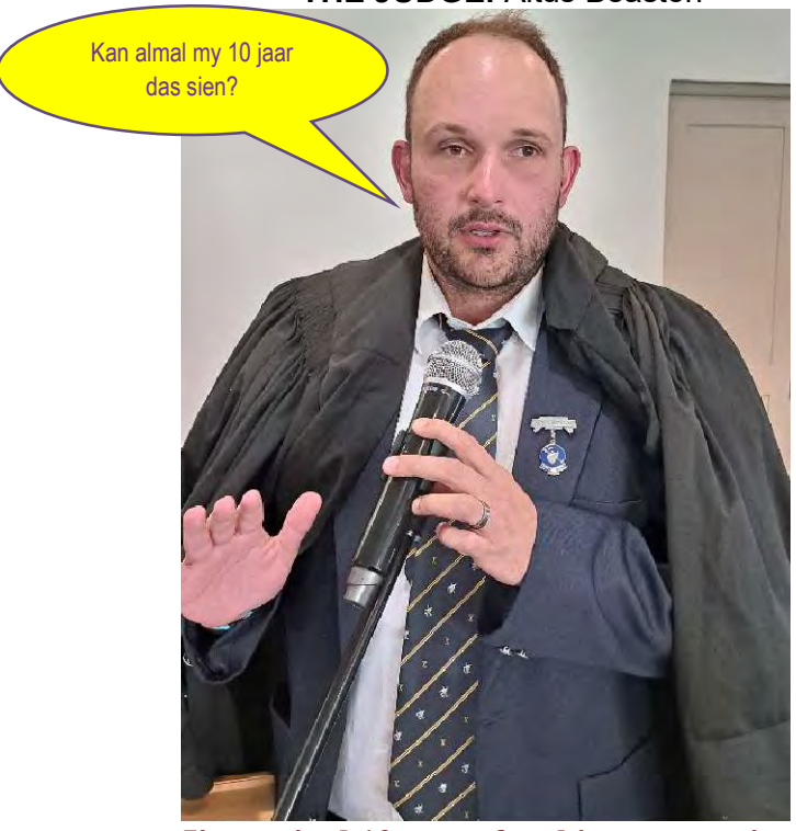
I've waited 10 years for this opportunity