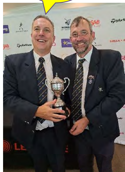
HERMAN BRAAM TROPHY (Lincon Construction Challenge: Old Toppies 27,55) vs Young Guns 29,82) Winner: Young Guns